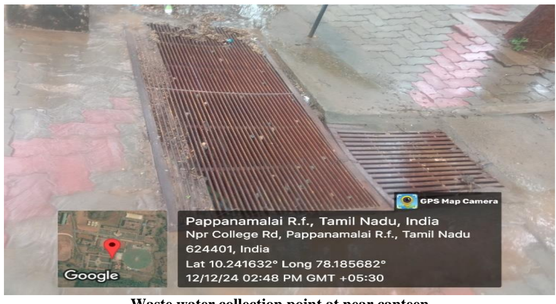
Waste water collection point at near canteen