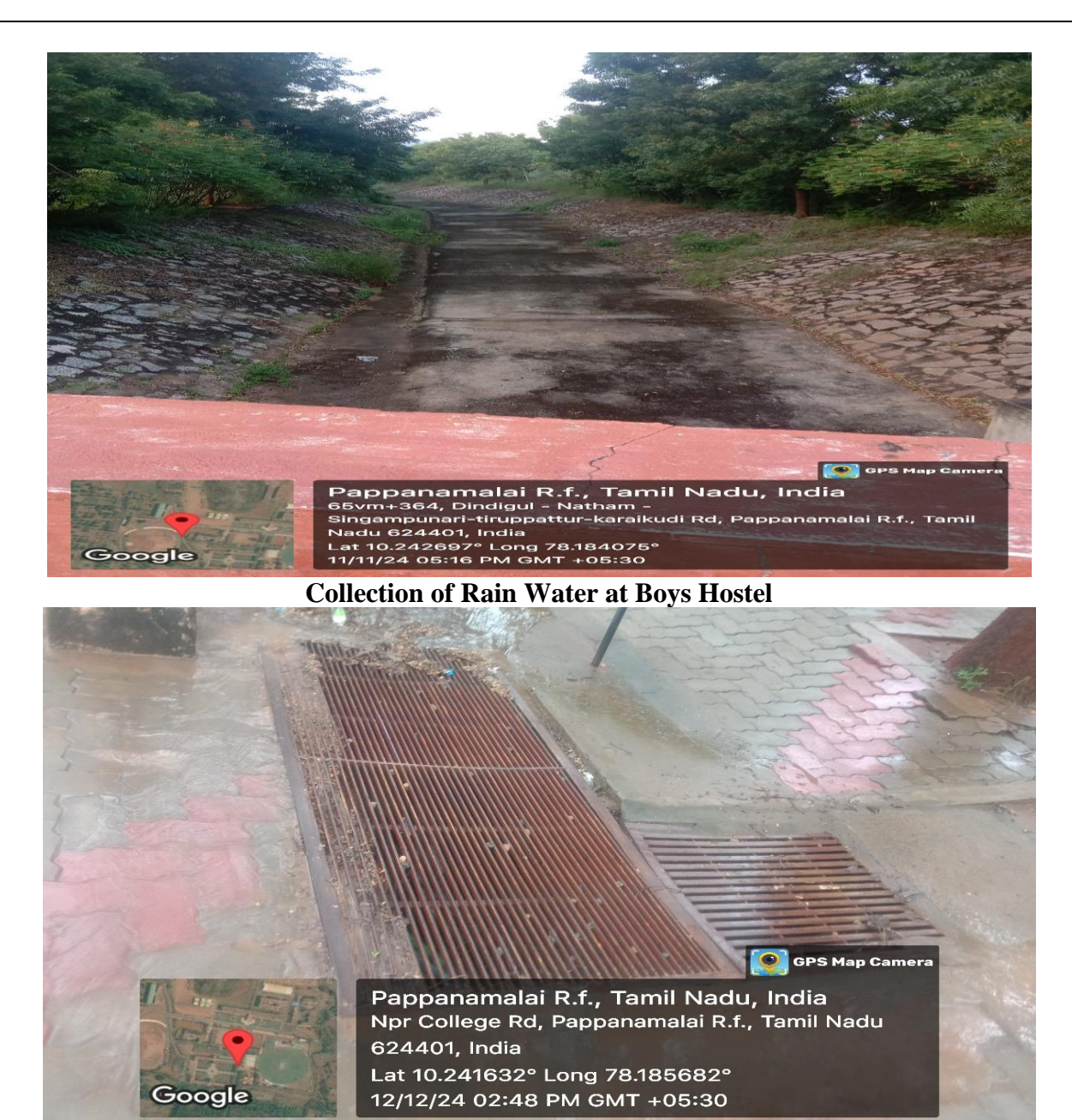
Collection of Rain Water from various points at Canteen

A comprehensive maintenance plan for both water bodies and the distribution system on campus ensures that NPR College can manage its water resources effectively, reduce waste, and promote sustainability. Regular monitoring, repair, and upgrades, combined with an emphasis on conservation, can help create a reliable, efficient water system that serves the college for years to come. By implementing best practices in water management, the college can reduce its environmental impact and contribute to global water conservation efforts.