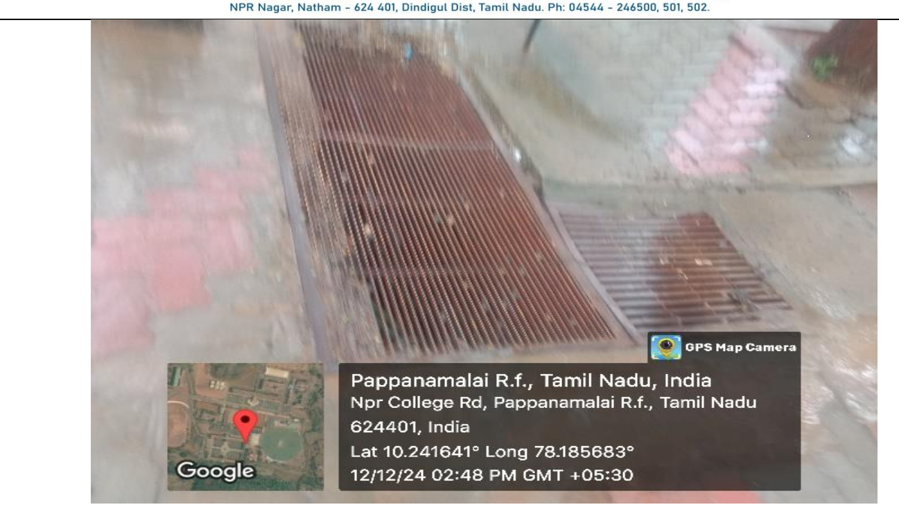
Rain Water collecting point at near canteen