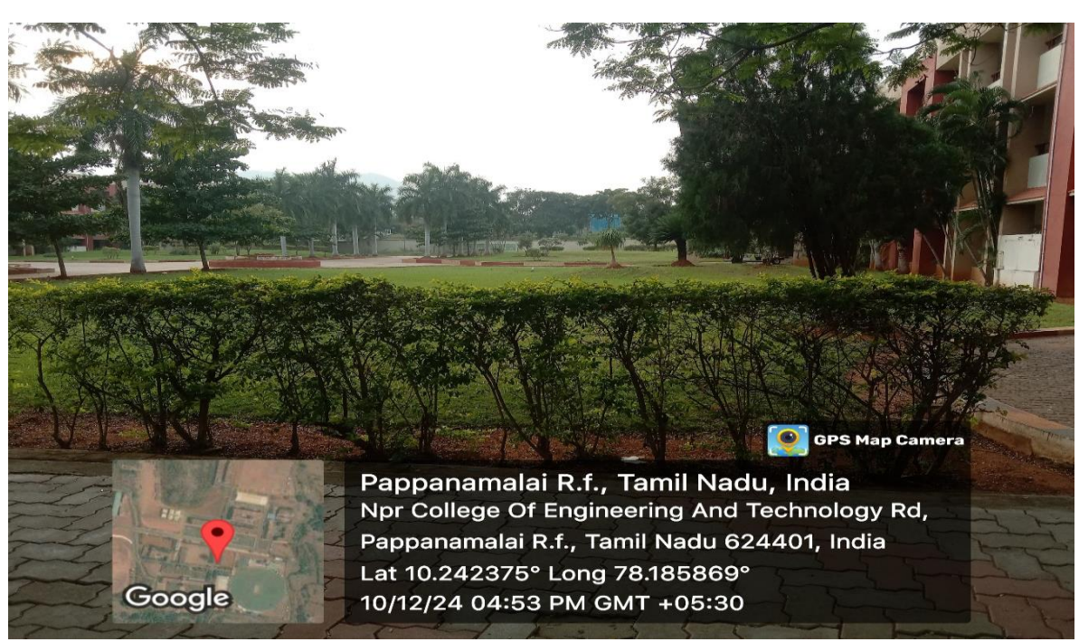
waste Water Utilization at Main block