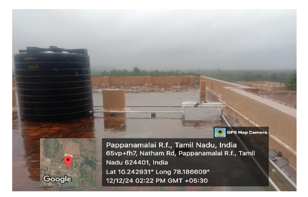
Water storage point at Rear block

tar Approved by AICLE, we beint & Amilateo to Anna Oniversity, Chennal Accredited by NAAC with A GRADE Recognized by UGC under 2 (f) | ISO 9001:2015 Certified | Web: www.nprcolleges.org | E-Mail: nprcetprincipal@nprcolleges.org NPR Nagar, Natham - 624 401, Dindigul Dist, Tamil Nadu. Ph: 04544 - 246500, 501, 502.