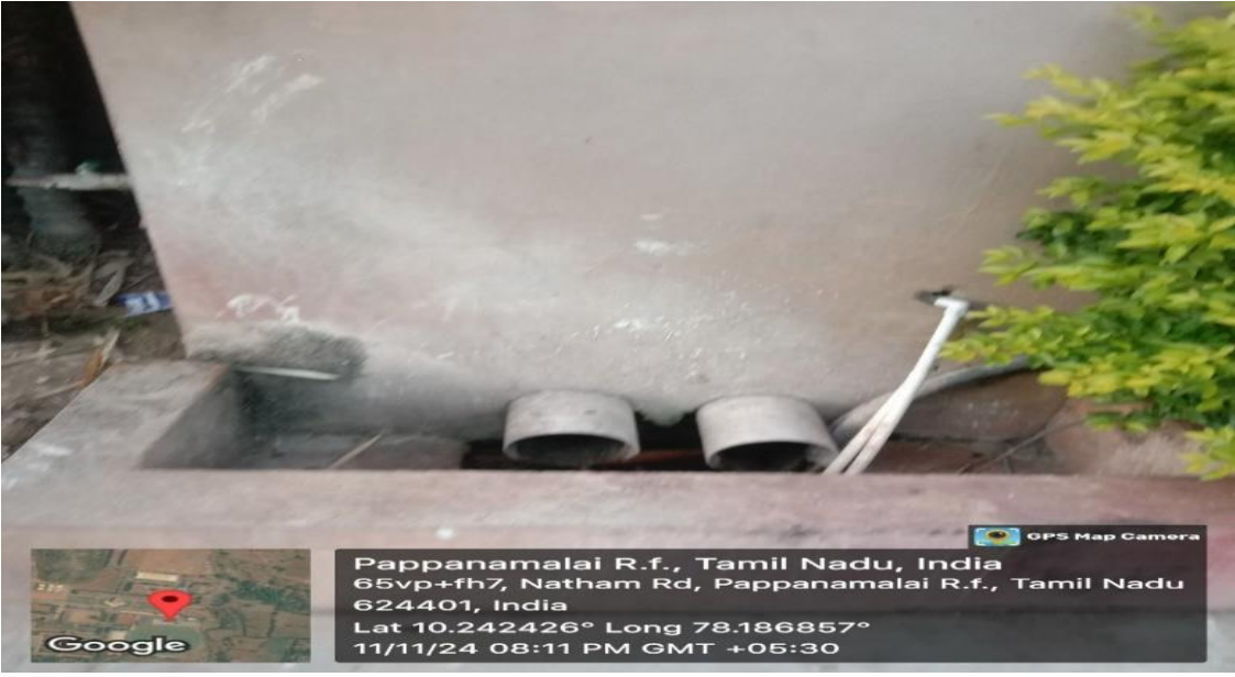
Waste water collection point at near Girls hostel

The construction of tanks and bunds at NPR College of Engineering and technology will significantly contribute to water conservation, flood control, and soil erosion prevention. These structures can help the college reduce its dependency on external water sources, recharge local groundwater, and improve the campus environment. Additionally, such efforts will serve as an educational tool for students and staff, fostering a culture of sustainability and responsible water management.