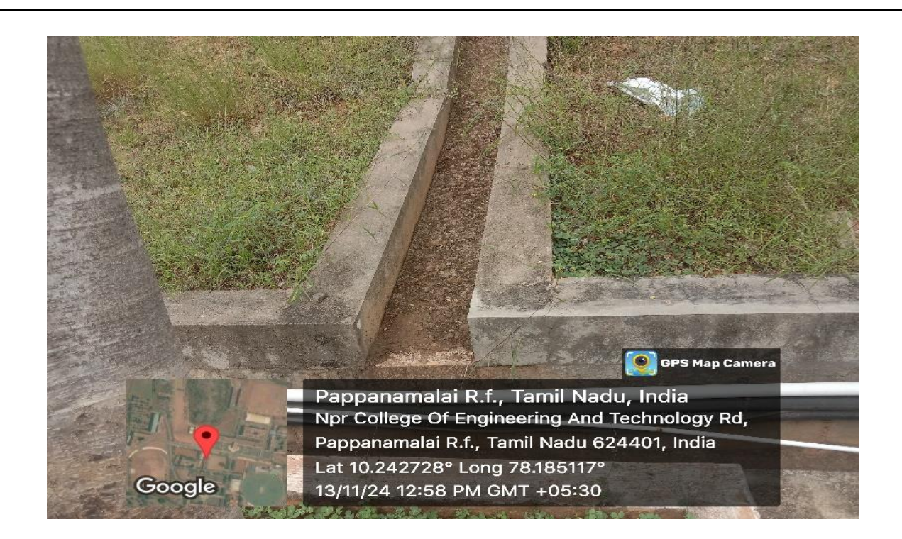
Collection of Rain Water from various point at Main block Back side

Approved by AICTE, New Delhi & Amiliated to Anna University, Chennal | Accredited by NAAC with 'A' GRADE Recognized by UGC under 2 (f) | ISO 9001:2015 Certified | Web: www.nprcolleges.org | E-Mail: nprcetprincipal@nprcolleges.org NPR Nagar, Natham – 624 401, Dindigul Dist, Tamil Nadu. Ph: 04544 – 246500, 501, 502.