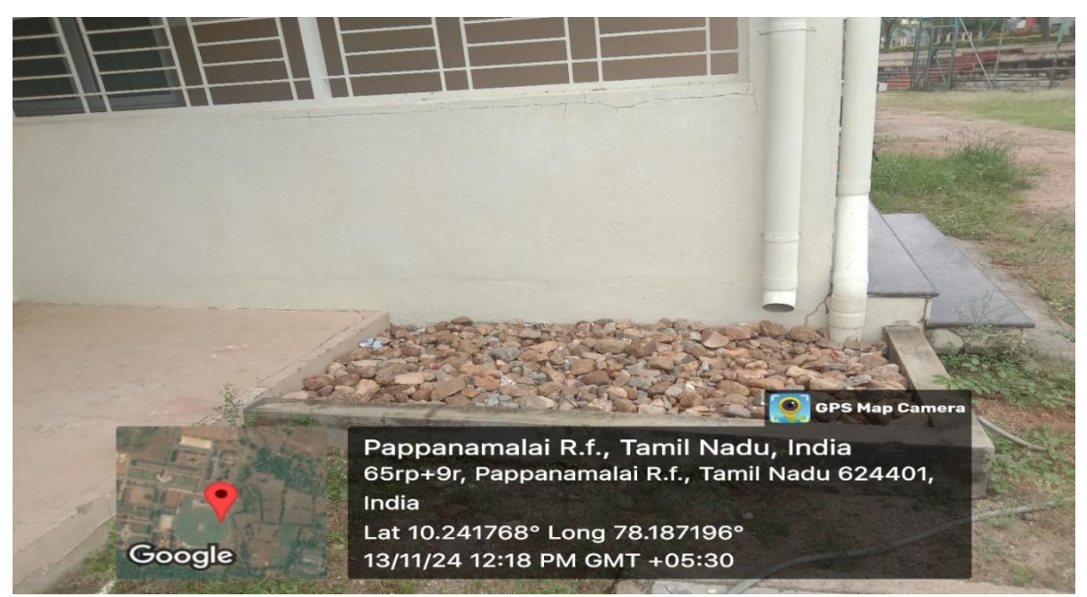
Rain Water collecting point at Cricket ground

NPR College's adoption of a rainwater harvesting system would not only conserve water but also contribute to environmental sustainability, reduce operational costs, and serve as an educational tool to inspire future generations.