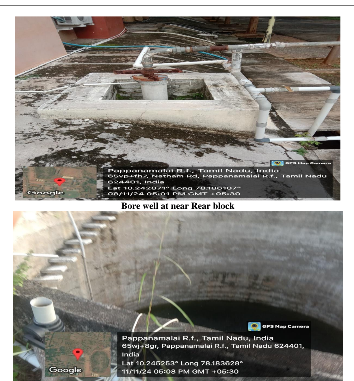
Open well at near Transport Parking Place

Bore well and open well recharge is an effective method of replenishing groundwater levels, which can become depleted due to over-extraction or changing climate conditions. By implementing recharge techniques at NPR College, the institution can help address water scarcity, promote sustainable water use, and play an active role in environmental conservation. Here's a detailed look at how bore well and open well recharge can be implemented at NPR College.