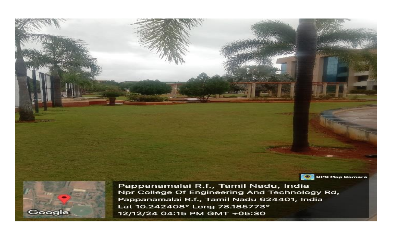
Water stored for Irrigation use at Garden Main block front side