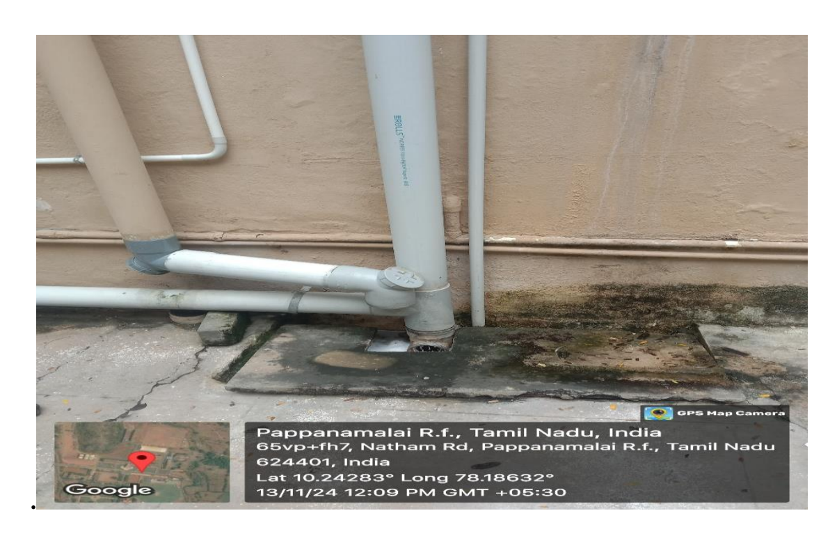
Waste water collection points at Main block Back side