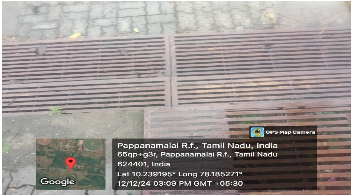
Rain Water collecting point at near canteen