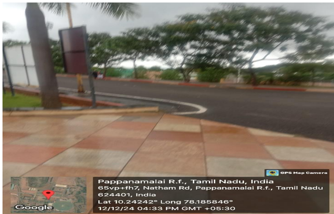
NPRCET Friendly Pathway