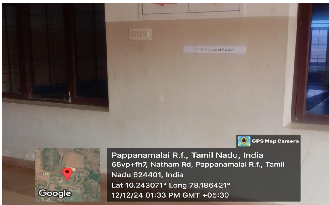
Plastics Ban area at College campus