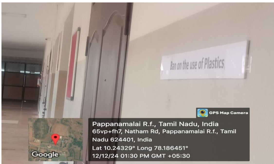
Plastics Ban area at College campus

The implementation of a ban on the use of plastics at NPR College is a significant step toward promoting environmental sustainability, reducing campus waste, and fostering a culture of eco-consciousness. This policy aims to minimize the harmful impact of single-use plastics and encourages the adoption of sustainable alternatives among students, staff, and visitors.