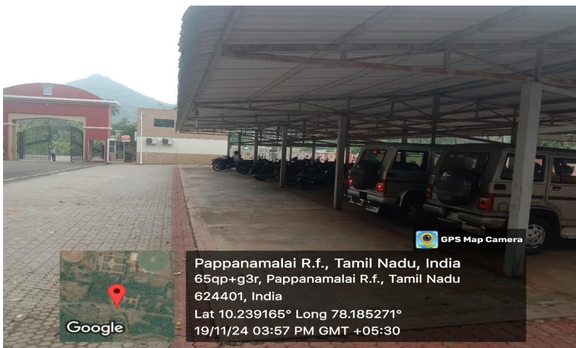
Parking for vehicles at Inside college campus