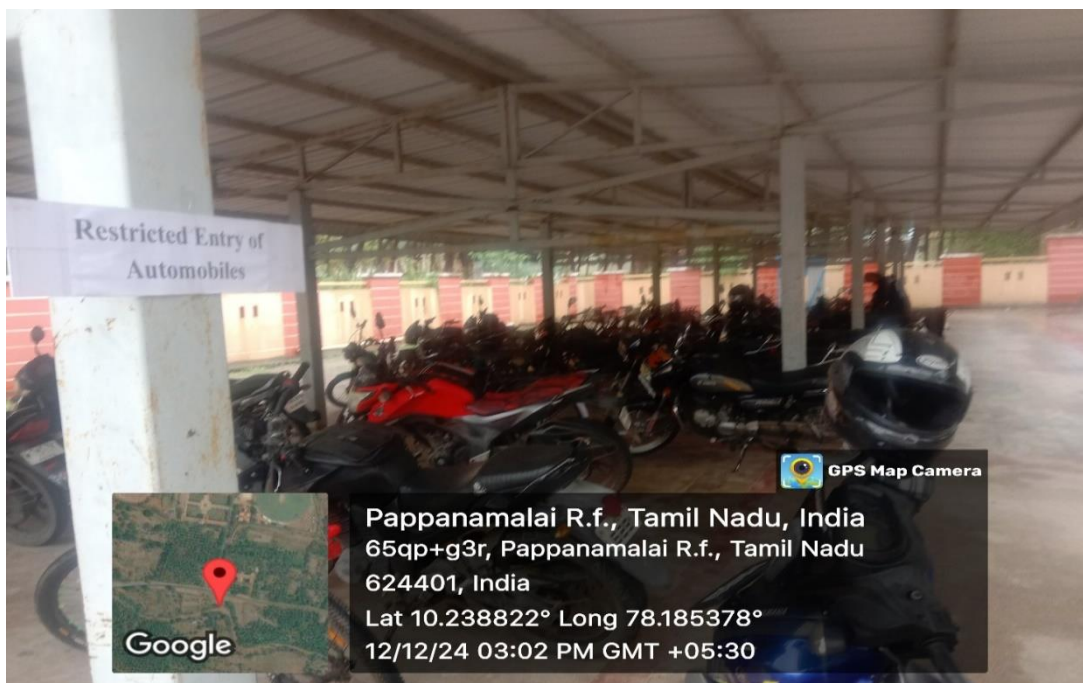
Vehicles entry Restricted area at college campus