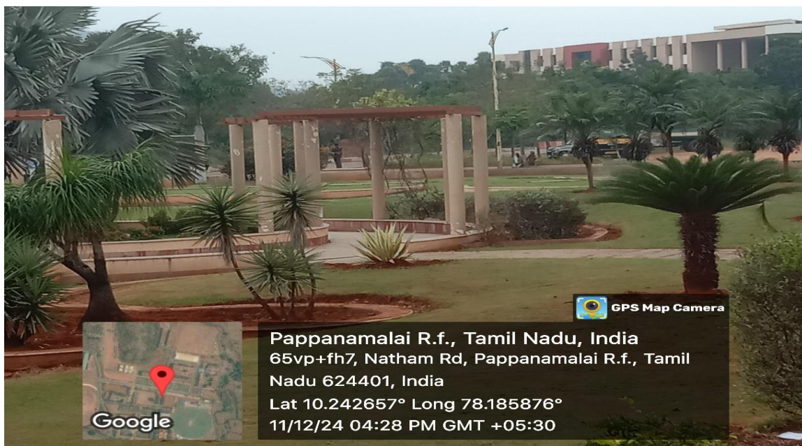
Landscaping with trees and plants