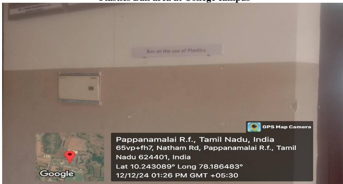
Plastics Ban area at College campus