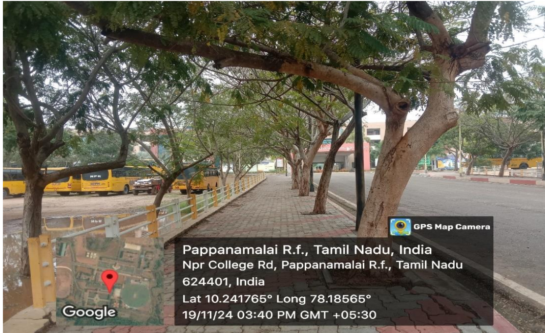
NPRCET Friendly Pathway