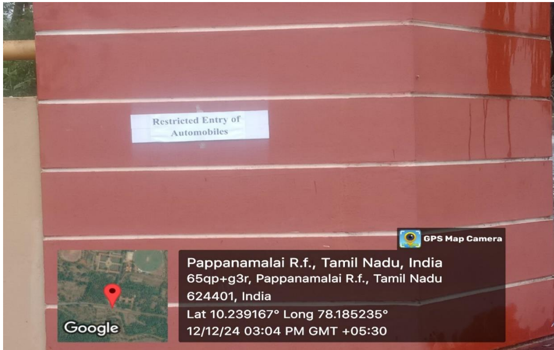
Vehicle Entry Point at College Entrance