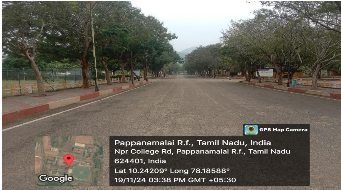
Landscaping with trees and plants

To design a landscaping plan for NPR College with trees and plants, you'll want to consider factors like the local climate, aesthetics, and functionality. Here's a vision for landscaping that could enhance the atmosphere of the college campus