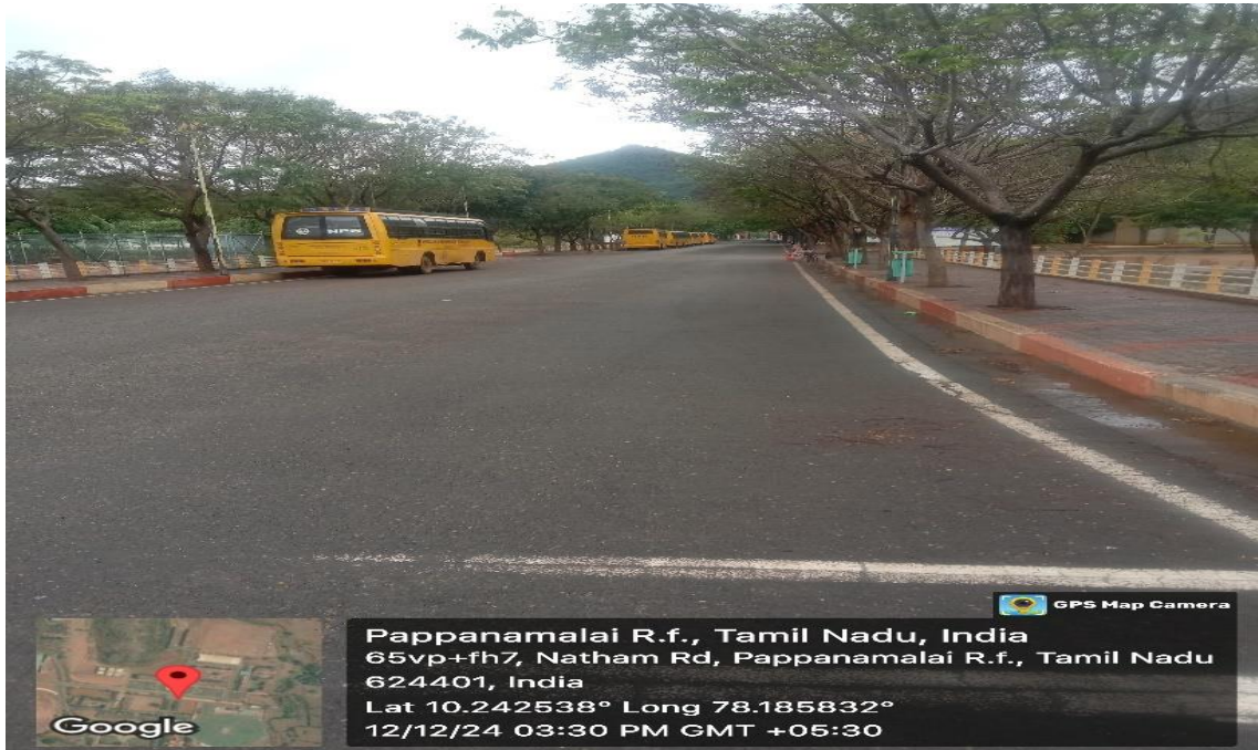
NPRCET Friendly Pathway