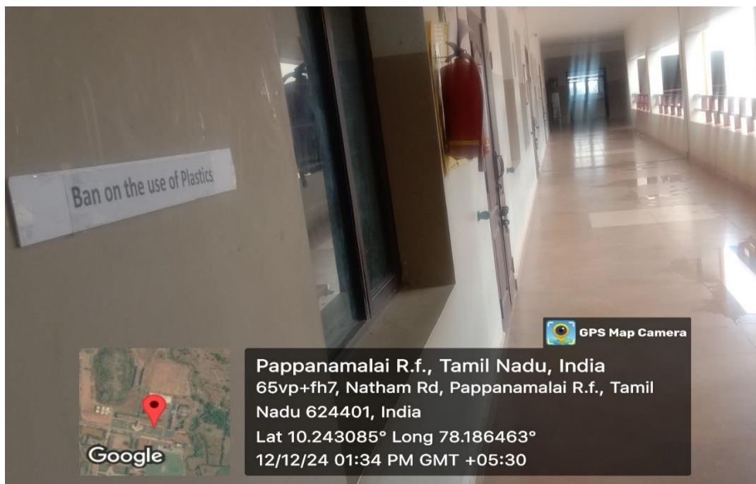
Plastics Ban area at College campus