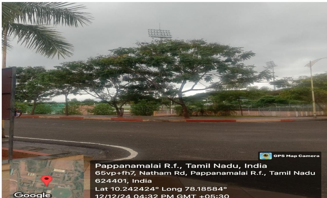
NPRCET Friendly Pathway