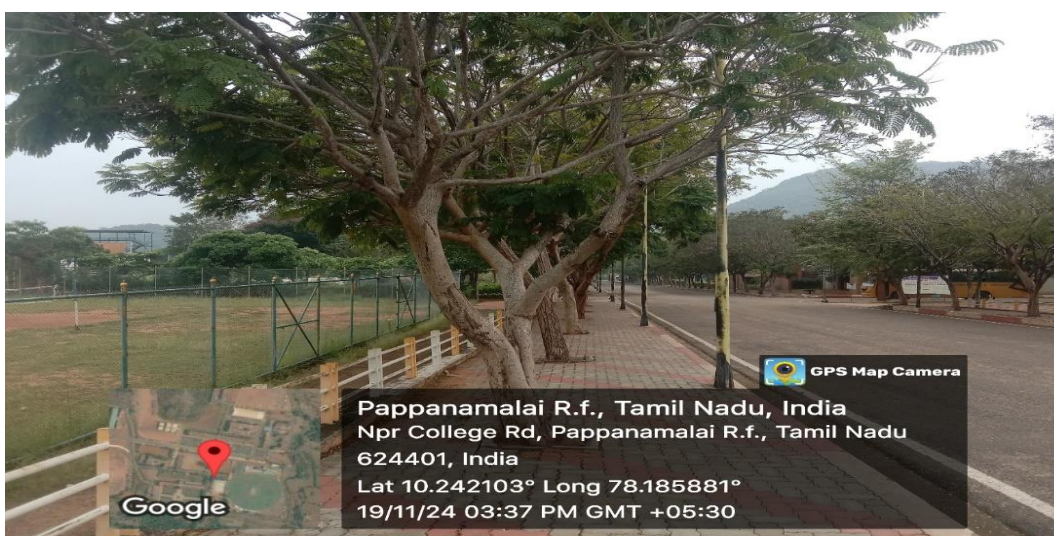
NPRCET Friendly Pathway