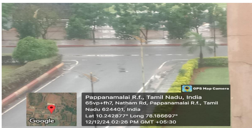
NPRCET Friendly Pathway

Pedestrian-friendly pathways at NPR College of Engineering and technology are a fundamental component of creating a safe, functional, and aesthetically pleasing campus. By prioritizing the needs of pedestrians, these pathways not only ensure efficient movement across the campus but also enhance overall student experience. Well-designed walkways foster a sense of community, encourage walking and cycling, and contribute to a healthier, more sustainable campus environment. By implementing these features, NPR College would help to create an accessible, sustainable, and attractive space where all members of the campus community can navigate with ease and enjoy their surroundings.