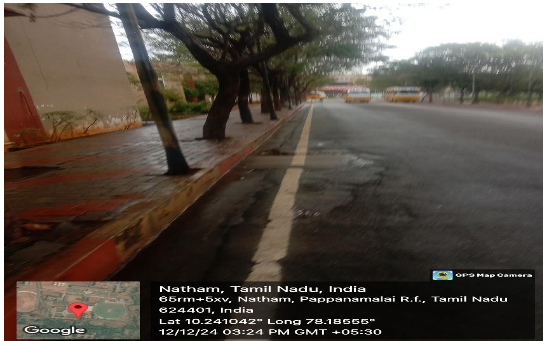
NPRCET Friendly Pathway