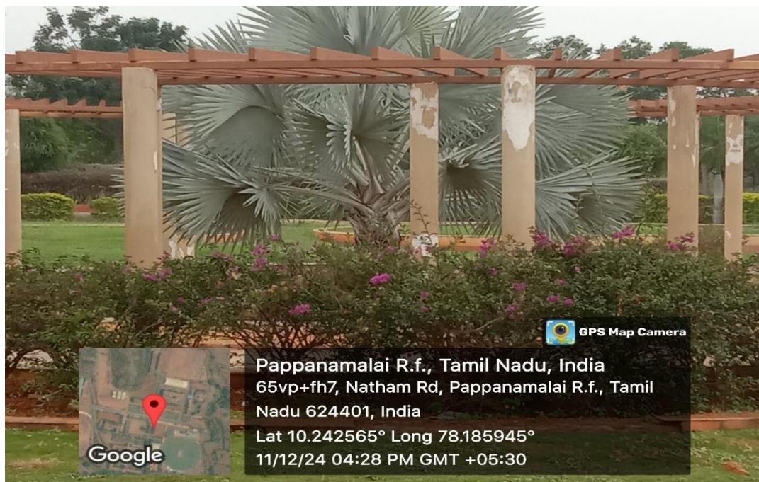
Landscaping with trees and plants