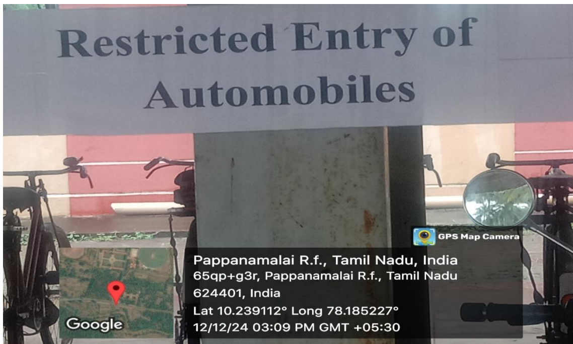
Parking for vehicles at College Entrance