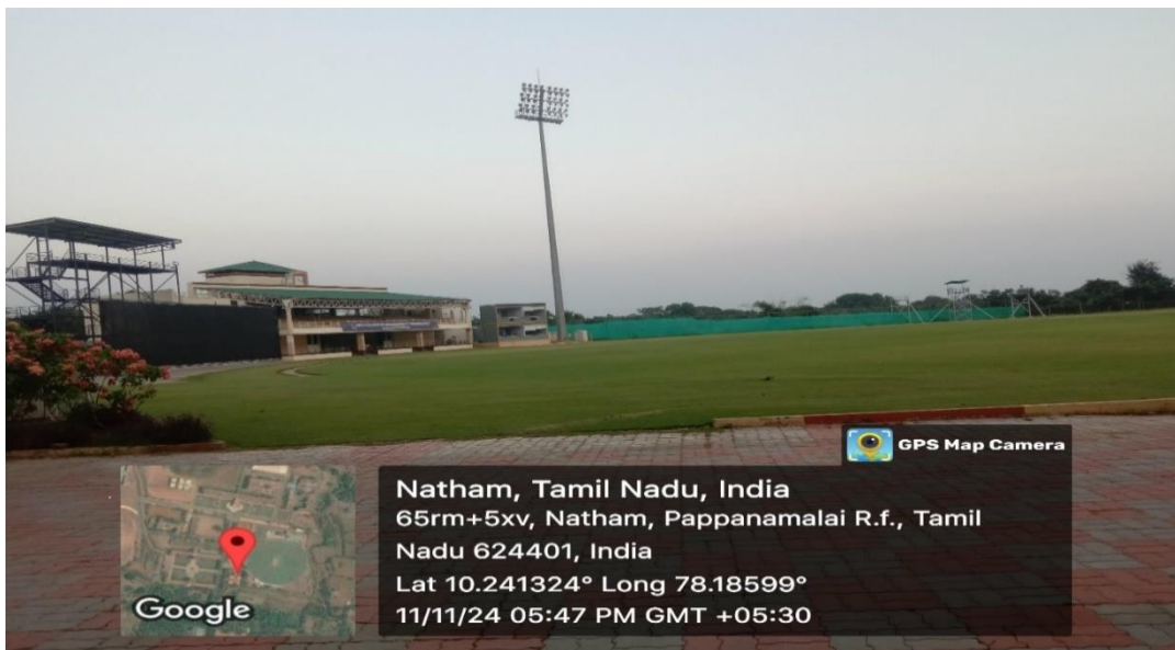
NPRCET Turf cricket Ground

Designing a Turf Cricket Ground for NPR College involves creating a balance between functionality, aesthetics, and durability. The cricket ground should be not only practical for sports but also a well-maintained space that enhances the campus environment. Here's a vision for the landscaping of the cricket ground: