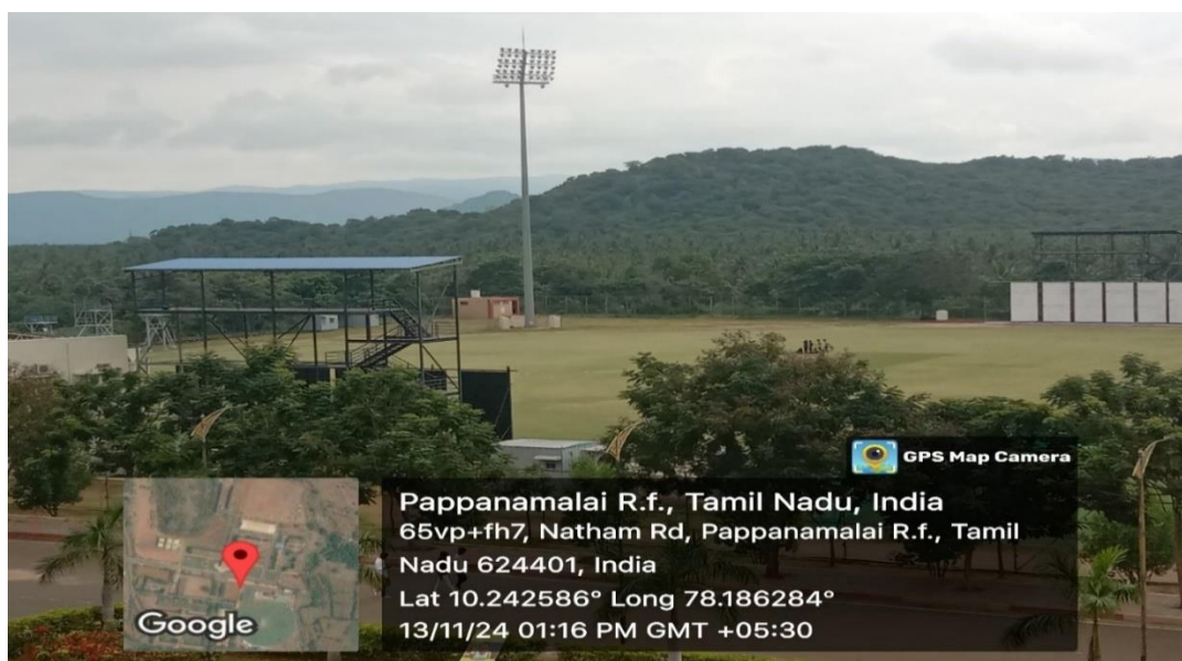
NPRCET Turf cricket Ground