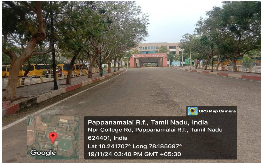
Landscaping with trees and plants