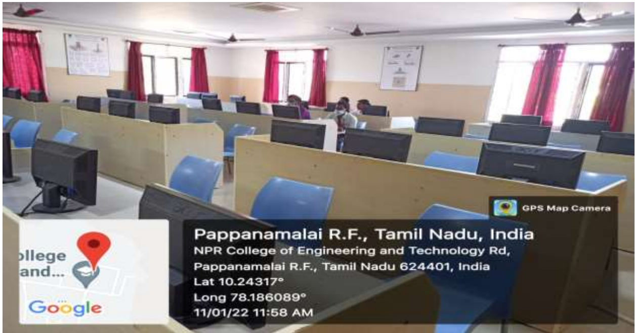
CIVIL CADD LAB