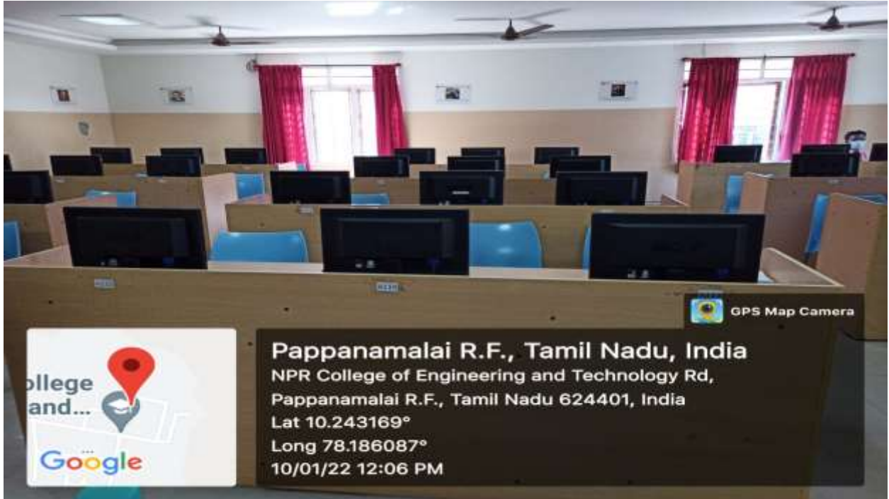
PSS LAB IN EEE