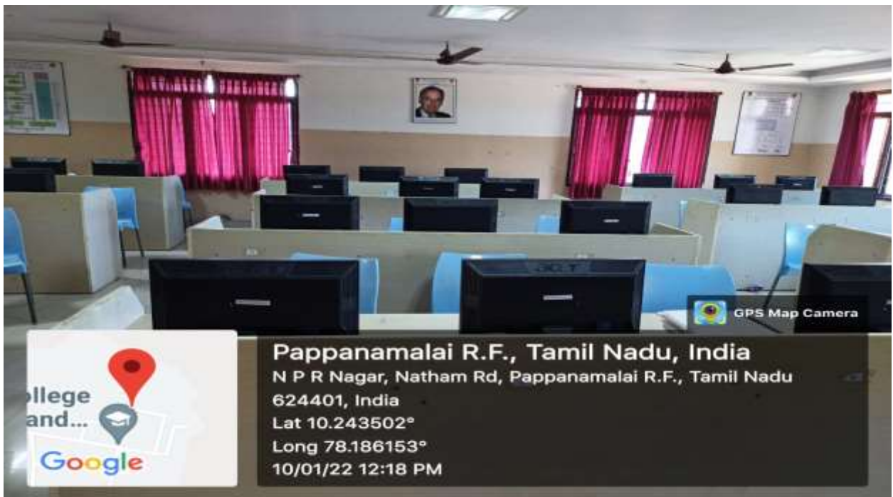
EMBEDDED LAB IN ECE