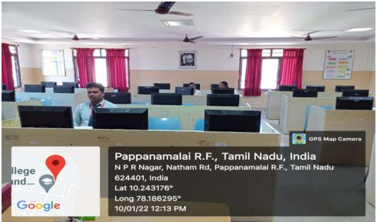
VLSI LAB IN ECE