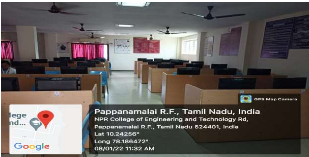
CSE MAIN LAB