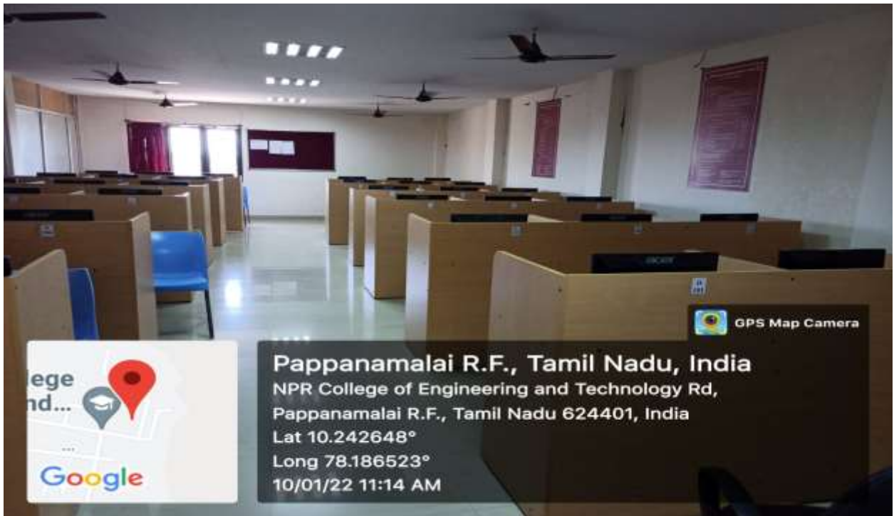
COMMUNICATION LAB IN ENGLISH