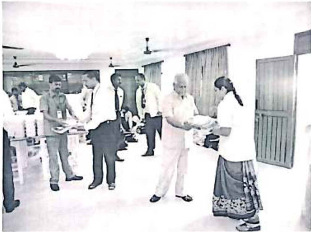
Diwali Gift to Teaching and Non Teaching Staff