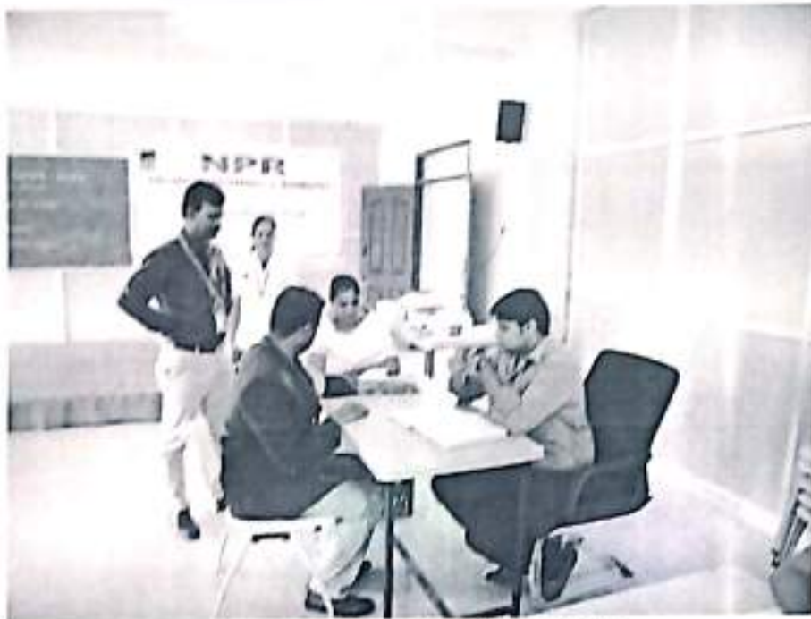
MEDICAL CHECK-UP FOR FACULTY